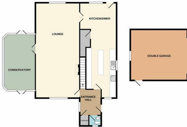
GROUND FLOOR APPROX. FLOOR AREA 1312 SQ.FT. (121.9 SQ.M.)